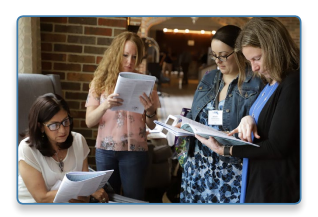
Conference attendees plan their day's schedule.