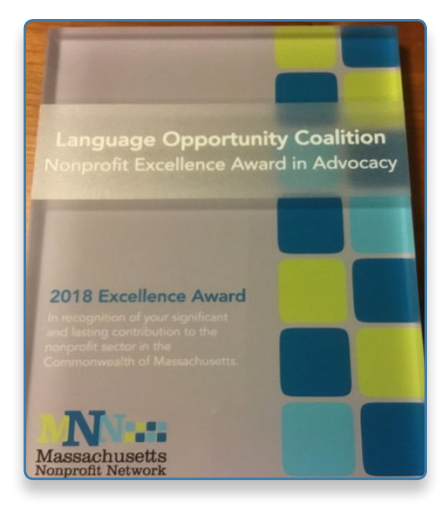
The Nonprofit Excellence Award in Advocacy is given to the Language Opportunity Coalition.

This year, MNN's independent panel of nonprofit and business leaders reviewed over 150 Excellence Award nominations that highlighted the incredible work of nonprofits across the state. The finalists range from large education providers to small arts organizations. These 27 nonprofits and individuals are improving communities across the Commonwealth, representing every region of Massachusetts from the Berkshires to the Cape. One finalist from each