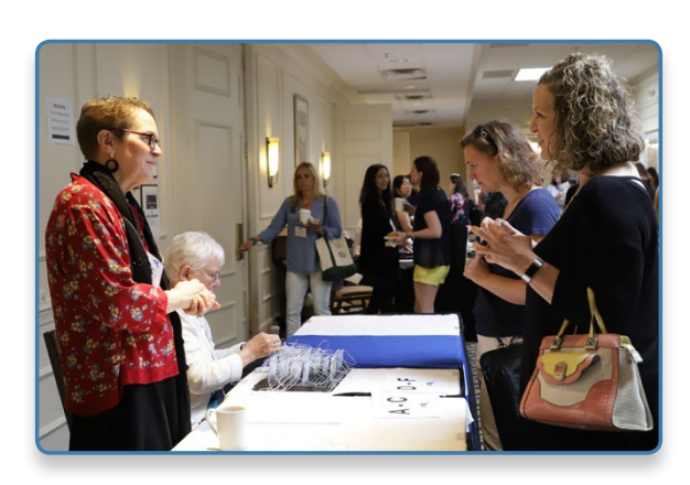
Conference arrivals check in at the registration desk.