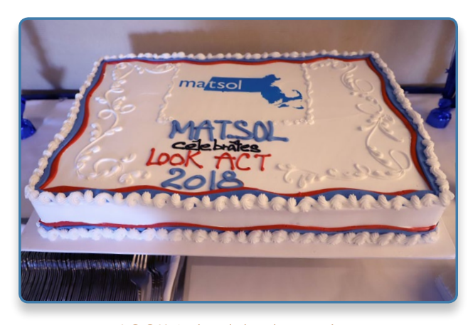
LOOK Act celebratory cake

Our Thursday evening festivities ended with a celebration of the passage of the LOOK Act ("An Act Relative to Language Opportunity for our Kids"), which was signed by the Governor on November 22. The LOOK Act overturns Massachusetts' "English-Only" law (2002 Ballot Initiative Question 2), which mandated that, with limited exceptions, Massachusetts students should be taught only in English. The new legislation encourages