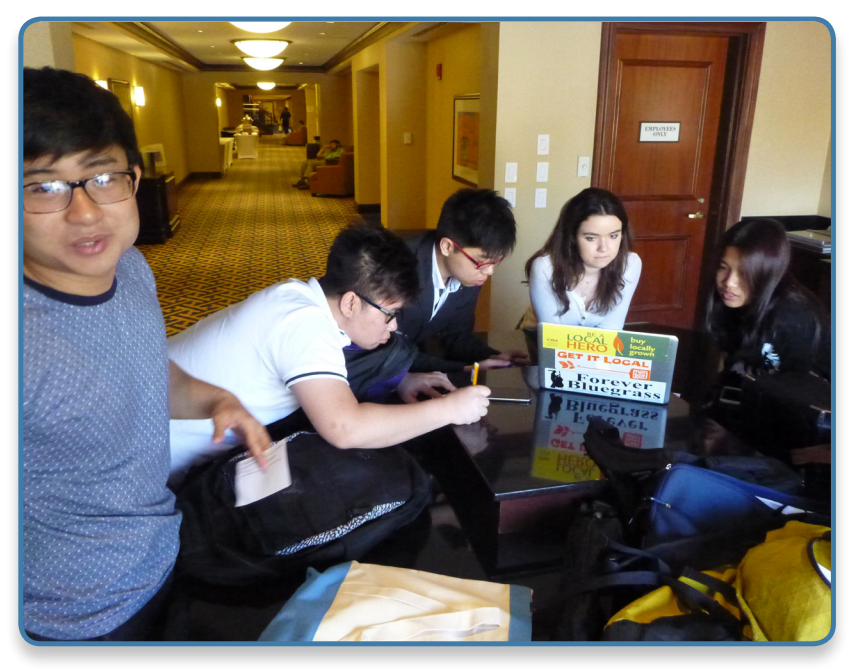
Students make last-minute preparations for their presentation

All the members of our team were extremely excited and nervous because for all of us it was our first time of presenting something outside the classroom, especially in front of such a highly educated audience. However, despite all our fears, as soon as we entered, we were welcomed very nicely by MATSOL's president and its executive director. They personally talked to us and cheered our group up, which was very helpful and lovely. It was scary for our group to be the only students at this conference, but at the same time it made us feel even more proud, as if we were an exclusive group of selected students. We are very thankful to the director of this conference for providing us such a great oppor-